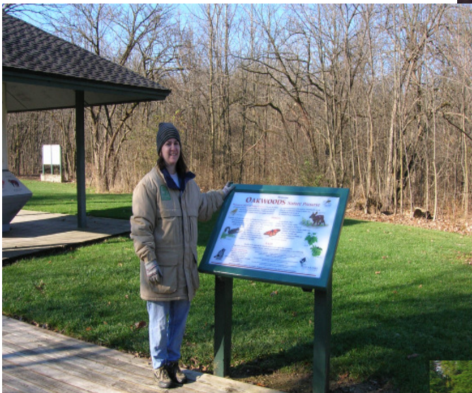
Signage welcomes visitors to the nature preserve.