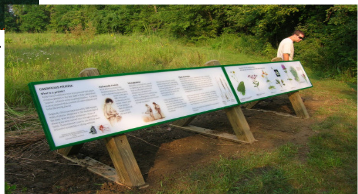
An interpretive sign at the prairie area.