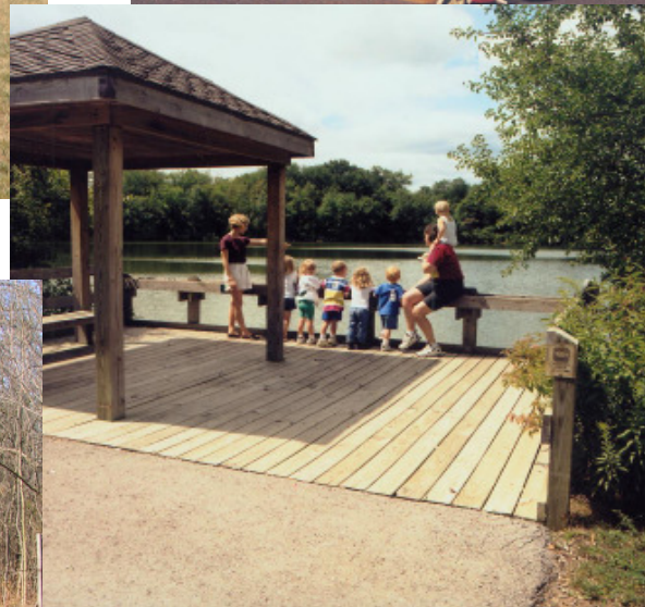
A public fishing deck overlooks Shank's Lake.