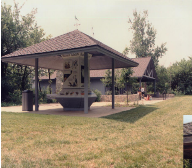
An interpretive kiosk is located outside.

Exhibits inside educate people about the nature preserve.